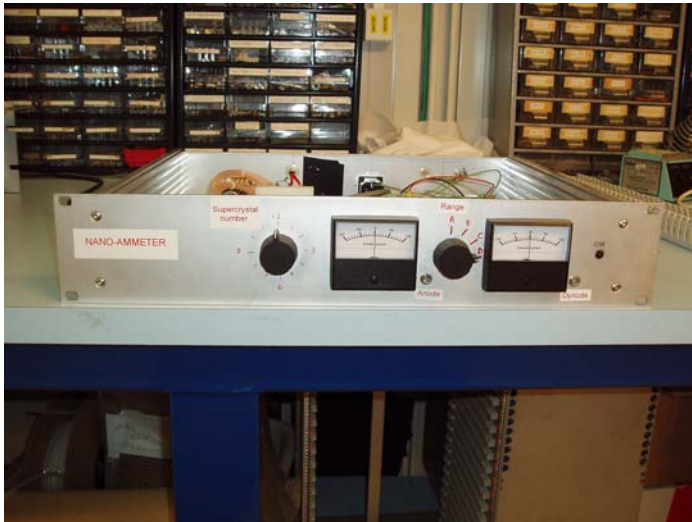
Figure 1 Front panel of Nanoammeter

(1) Front panel description – see figure 1