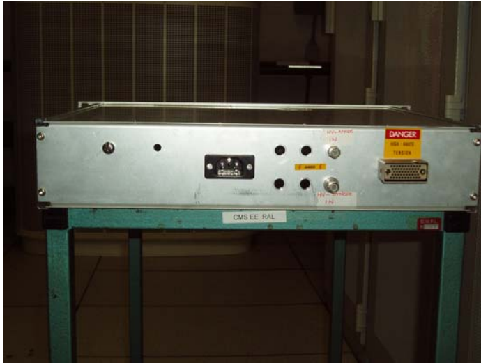
Figure 2 Rear panel of Nanoammeter

The rear panel has a mains connector, two SHV connectors and a 51-way Redel connector. The mains connector is an IEC socket for 230V ac mains. The SHV connectors are Anode HV in, and Dynode HV in. They are fed from the CAEN power supply, usually from the two ‘Test’ channels. The Redel connector is for the output HVs to the 12 SCs.